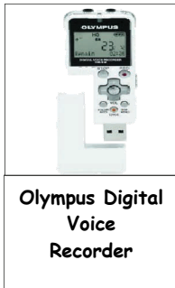
Olympus Digital Voice Recorder

$60 and $80. The Sony will hold over 290 hours of recording; the Olympus,