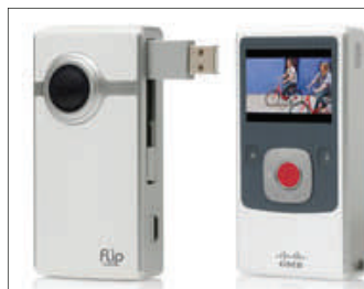
FLIP Video Ultra-HD One-Hour

teacher, however, you are able to purchase one and get one free right now from the Digital Wish Foundation ( click here ). You could receive four cameras for a total of $300. The particular model for which this offer is being made records and stores one hour of video. If you have some available budget money, you might want to think about a purchase from the Digital Wish Foundation.