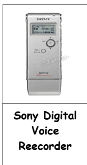
Sony Digital Voice Recorder

The other method for recording podcasts is to use a mobile recording device and then to move the audio to a computer later. This is an excellent method if you are going to be mobile or want students working in small groups. The best devices dedicated for audio recording are the Sony ICDUX70 Digital Voice Recorder and the Olympus WS-110 WMA Digital Voice Recorder . Both sell for between