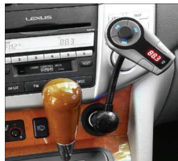
GOgroove FlexSMART X2 Advanced Wireless Car Speaker

There are two products I wish I could be recommending, but I feel they are still evolving, so I'm impatiently waiting. The first is a wireless reading device. Each model has its limitations and the jury is out on the winner. I would like to