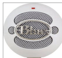
Blue Snowball Microphone

software is Audacity http://audacity.sourceforge.net . It is free. Mac users are provided with the program Garage Band, which is easy to use. The best tool for getting audio into your computer is a Blue Snowball Microphone . It costs around $70. It is excellent for the classroom because it comes equipped with three settings that allow for ideal recording of an individual, a small group, or the entire room. I have used this effectively to record in many settings.