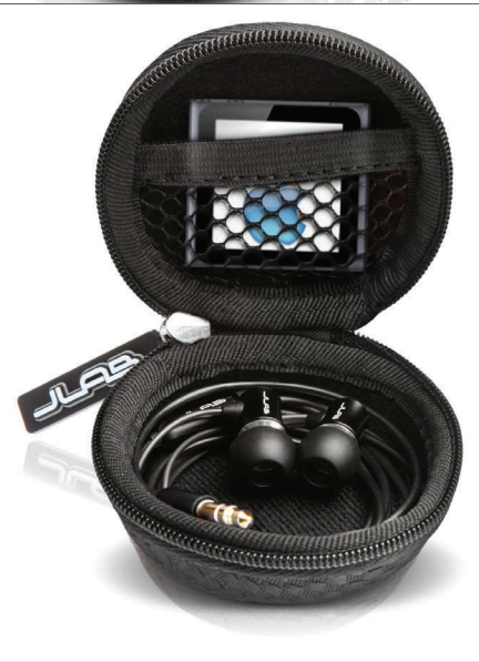
JBuds J3 Micro-Atomic In-Ear Earphones with Case

case also does a pretty good job of keeping the headphones untangled.